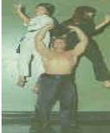
Mr. America, 1976 Kung-fu Master Ch'i Gong Kyokushin Karate 4th Dan Competitor in the World Strongest Man Men Contest Co-Holder of the 1979 World's Martial Arts Heavy Weight Title