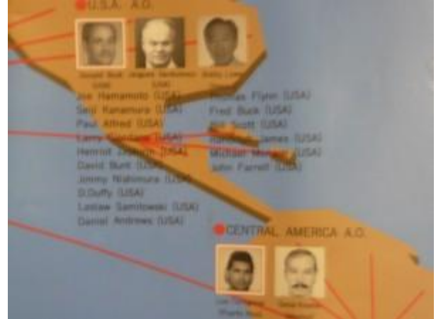
Branch Chiefs of the IKO in North America in 1993

Kung-fu and life. You are the Very Best! Thanks Dad Your son ,