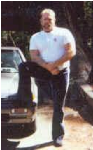
Redwoods Ca. Seminar