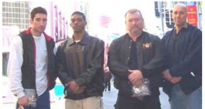
AKKO Fighting team from Sacramento California