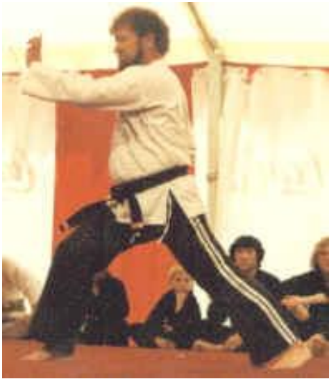
California State Championships