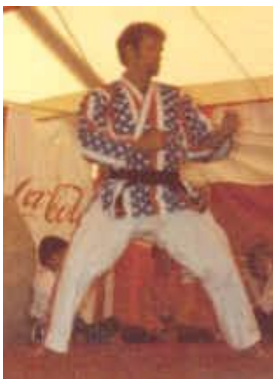
Demo California State Fair