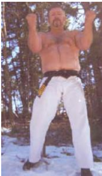
Colorado Snow training