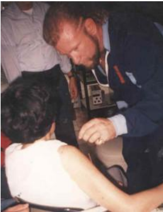
Acupuncture Class in Hong Kong

"I can never fulfill the shoes of my teachers and I won't try, I will only do what I think they would want me to do."